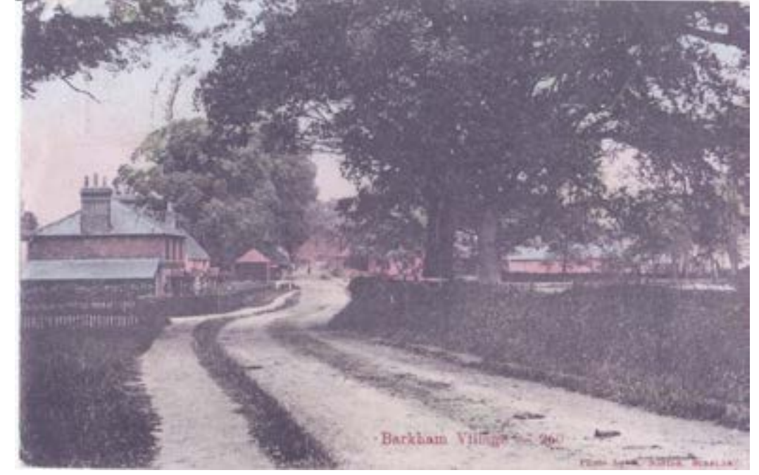
Barkham in 1907 - see page 12