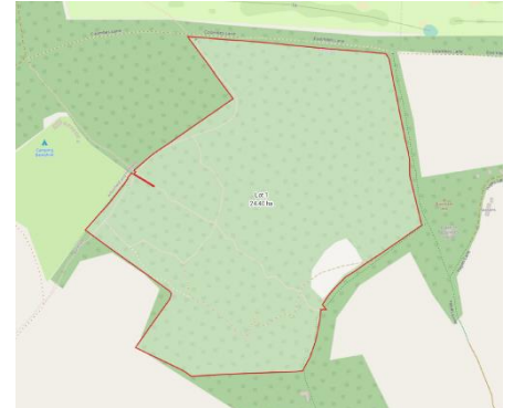
The plot of The Coombes owned by the parishes

The Coombes woodland is a rare area of ancient woodland in Wokingham Borough and has been enjoyed by local residents for many years. When the property was put on the market the Parish Councils decided they had to act to ensure that the woodland remained accessible to the public for the rest of time. Using Community Infrastructure Levy (CIL) money received from developers building homes across the parishes enabled the councils to purchase the woodland without financial recourse to the local residents.